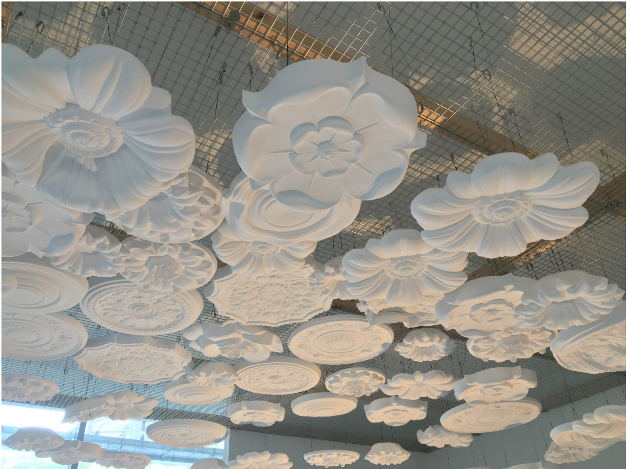
Figure 3: Sub Rosa (detail), Between Here and Then at Project Space, University of Westminster, July 2017

The first immersive space, Sub Rosa , was fully realised in the exhibition Between Here and Then at London Gallery West in July 2017. Sub Rosa is a large circular ceiling piece comprising 75 bone china ceiling roses. Together the roses span three metres, suspended in an upturned bowl formation echoing the upside-down placement of Aramaic bowls in Babylonian dirt floors. A large bone china rose, hand-carved and realistic,