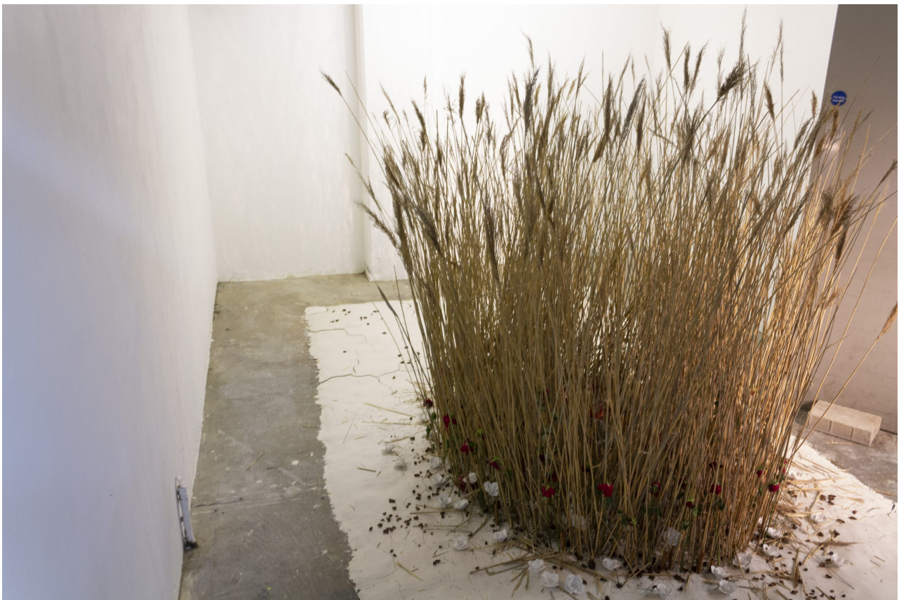
Figure 10: Lilith by the Red Sea Carpet , 2018–19. Unfired porcelain, fired clay elements, water reeds, roses, herbs, spices. Hyphen Exposition, at Ambika P3, University of Westminster, 22–27 March 2019

The second triptych space, Lilith by the Red Sea Carpet , is a rectangular floor piece constructed from unfired Ming porcelain, with a central nest-like medallion of tangled water reeds, roses, herbs, spices and ceramic elements. An indoor carpet-garden, it almost entirely covers the floor space, inviting the viewer to experience the multisensorial work closely by circumnavigating the narrow passage around it. Immediately after installation, Lilith Carpet has a smooth creamy surface, but as the unfired porcelain dries, it cracks to reveal the faint trace of a carpet pattern formed by its making processes. Lilith Carpet explores disquieting narratives surrounding Lilith. Her evocative tale holds centre stage in the magical thinking surrounding Aramaic bowls, and here in Lilith Carpet . A descendent of the lilitu in ancient Mesopotamian cuneiform texts,