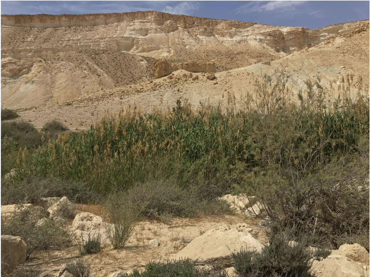
Figure 16: Phragmites australis growing in Negev Desert wadi, close to the Red Sea