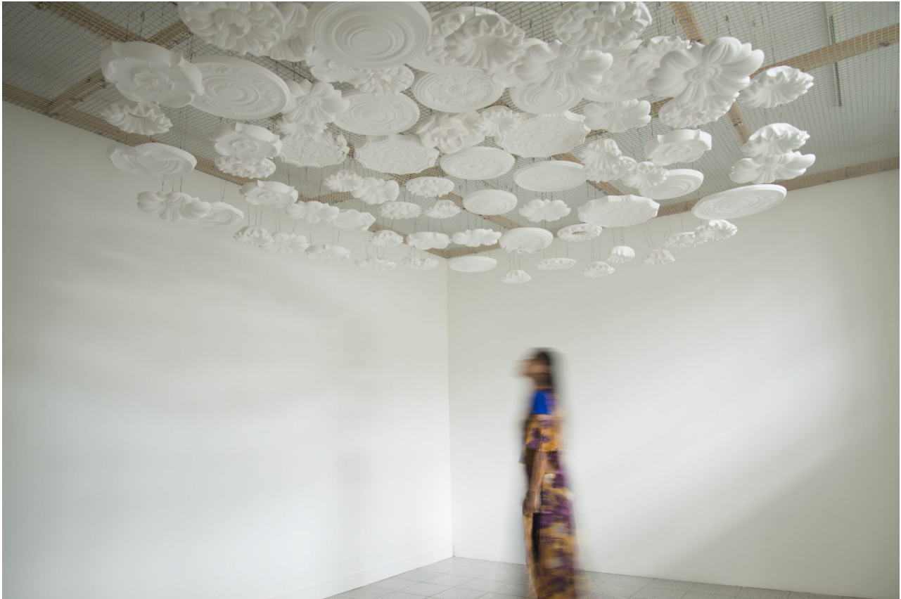
Figure 6: Sub Rosa, Between Here and Then at Project Space, University of Westminster, July 2017

The ceiling rose designs in Sub Rosa encompass different historical periods, including Tudor, Victorian, Edwardian, Georgian, Art Deco, Arts and Crafts and Modern periods, as well as motifs that date back to the Ancient Greeks, alluding to the non-linear layering of time, the perception of all time as cosmic concentric circles, and to Nippur's disrupted archaeological record (a point I will expand on later). These designs also carry their own individual narratives and symbols derived from the natural world, including the Greek acanthus leaf, the Palmyra rose, the Egg and Dart motif representing the continuous cycle of life, a native English briar rose, and an abundance of fruit reminiscent of the Garden of Eden. Sub Rosa embraces these symbols from the natural world but keeps at its heart the motif of the rose.