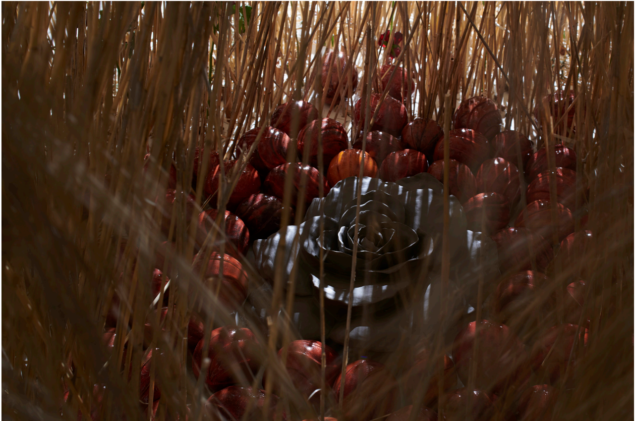
Figure 11: Detail of Lilith by the Red Sea Carpet , peering in towards the central carpet medallion

The plant/clay carpet is wild, a carpet growing its own motifs, sprouting its own source material. Strewed with swathes of wild thyme, rosehips, cinnamon bark, star anise and hand-formed porcelain roses, its powerful aroma is ambiguous, evoking variously an Ayurvedic 14 place of wellbeing, rest and recovery, Lilith's desert 'safe space', and a place of seduction. This multisensorial aspect invites the viewer to respond sensually through smell and tactility while also alluding to the plant imagery that infuses the Aramaic bowl texts. A love charm on Aramaic bowl AIT 28 in the Penn Museum details instructions for the use of herbs: