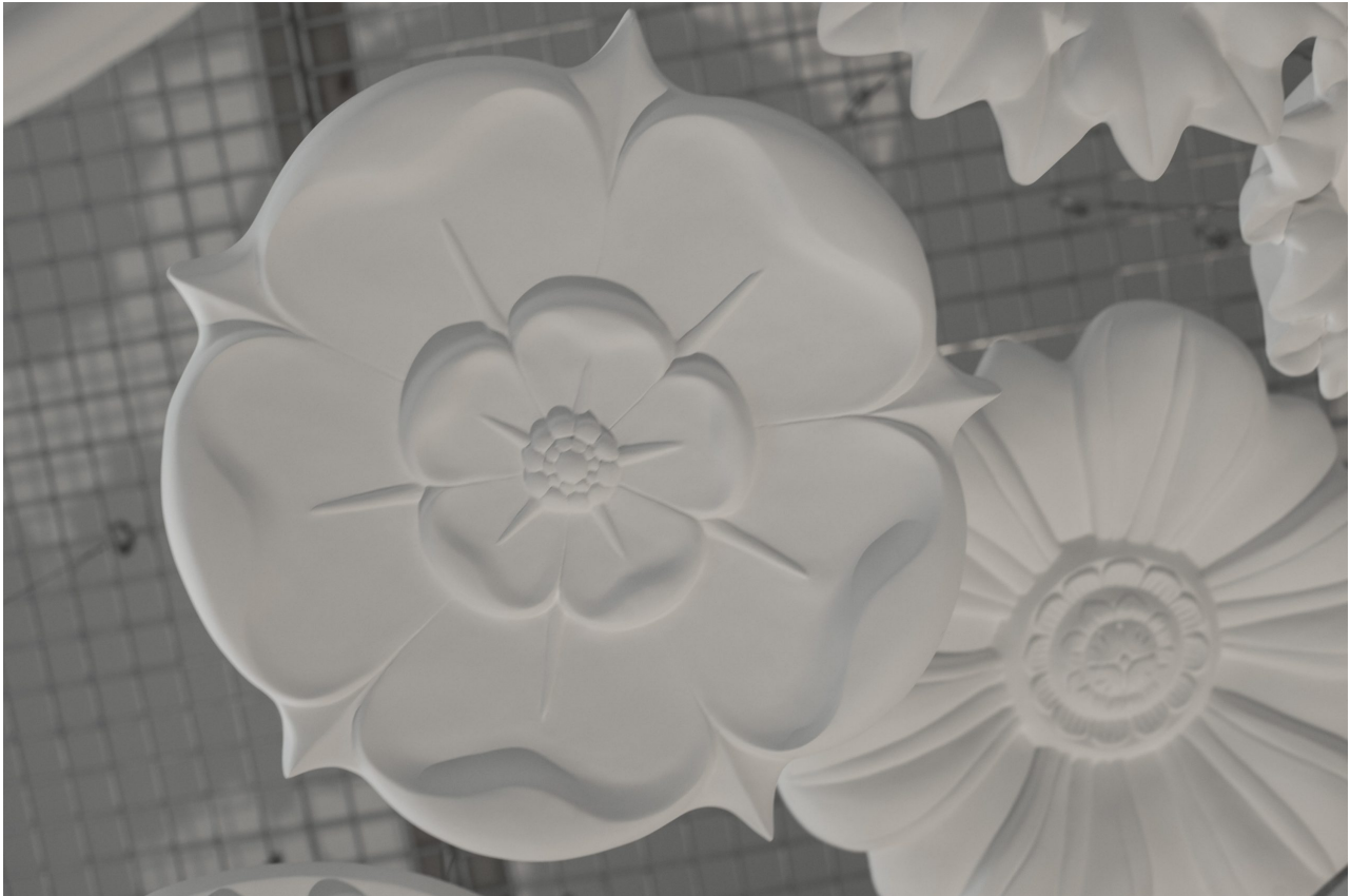
Figures 7–9: Sub Rosa , details of ceiling rose designs. From top: Egg and Dart design, acanthus leaf designs and concentric circle design. Briar rose design. Tudor rose design. Bone china. Between Here and Then at Project Space, University of Westminster, July 2017, image credits: Nedim Nazerali

The materiality of a work is integral to its semantic field. Bone china’s innovative component, investing the material with its superlative whiteness (and a dark secret at its heart), is 42 per cent animal bone. Living beings distilled back to basic elemental material are present in the work, infusing Sub Rosa metaphorically with the absent/presence of lives once lived, a material vehicle for the real but absent voices that we hear so tantalisingly in the bowl texts. The room-scape holds within it a silent-noise, the screaming presence of actual bodies, within these overlaid ecologies of life, of bone, of rose.