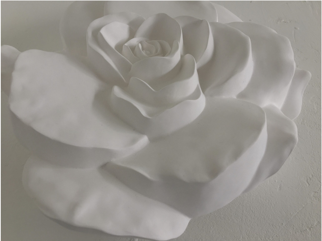
Figure 5: Central 'realistic' rose, 2017. Bone china, H 30cm W 45cm D 45cm. Projections In Space residency at University of Westminster, June 2019

Sub Rosa alludes in multiple ways to the Aramaic bowls: one of the ceiling rose designs features concentric circles, and the installation is suspended in a spiral format, visually echoing the circular layout of the majority of bowl texts. Aramaic bowl demon illustrations are usually found encircled in the bowls' interior centre, and in Sub Rosa , viewers who venture in find themselves in place of the demon or jinn , inside a circle, underneath an upturned bowl.