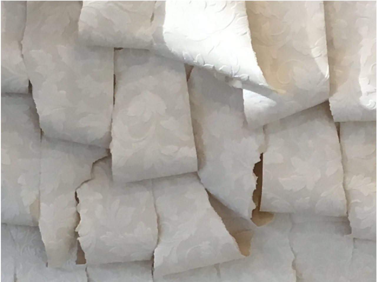
Figure 19: Paper mock-up of Flock, detail

In Flock , the third room in the triptych – a work begun in 2019 and still in production at the time of writing – porcelain wallpaper pieces entirely cover the walls of the exhibition space. The pieces lift away from the surface on which they are installed, as if about to take flight or on the verge of implosion, hovering between cohesion and eruption. There is a sense of building momentum, that this problematic wallpaper is no longer able to maintain its material and conceptual cover up. The viewer is invited into a claustrophobic disquieting-quieting white space, to enter the vortex of a frozen moment of fragmentation. Flock is also seductive and tactile, appealing to the senses rather than the conceptual – visitors want to touch the wallpaper and reach forward surreptitiously to do so – and this evokes the sensuality of Lilith, indicated in the blowsy overblown roses of the Aphrodite wallpaper design. The rose whispers quietly at the core of both Sub Rosa and Lilith by the Red Sea Carpet , but in Flock it looms large.