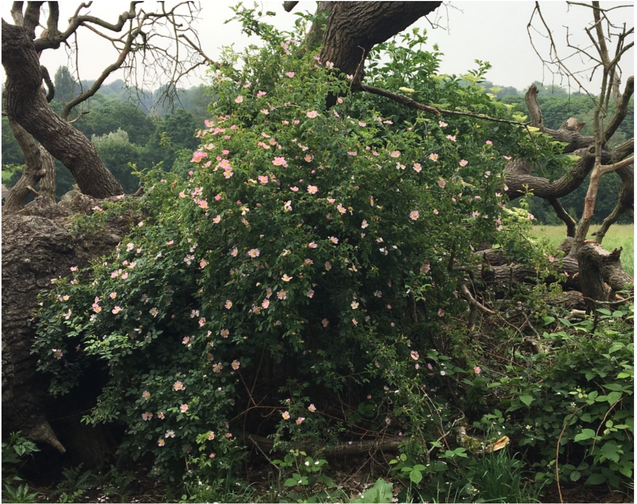
Figure 4: Native Dogrose, Hampstead Heath, London