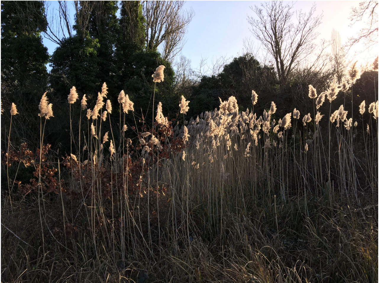
Figure 17: Phragmites australis growing on Hampstead Heath, London