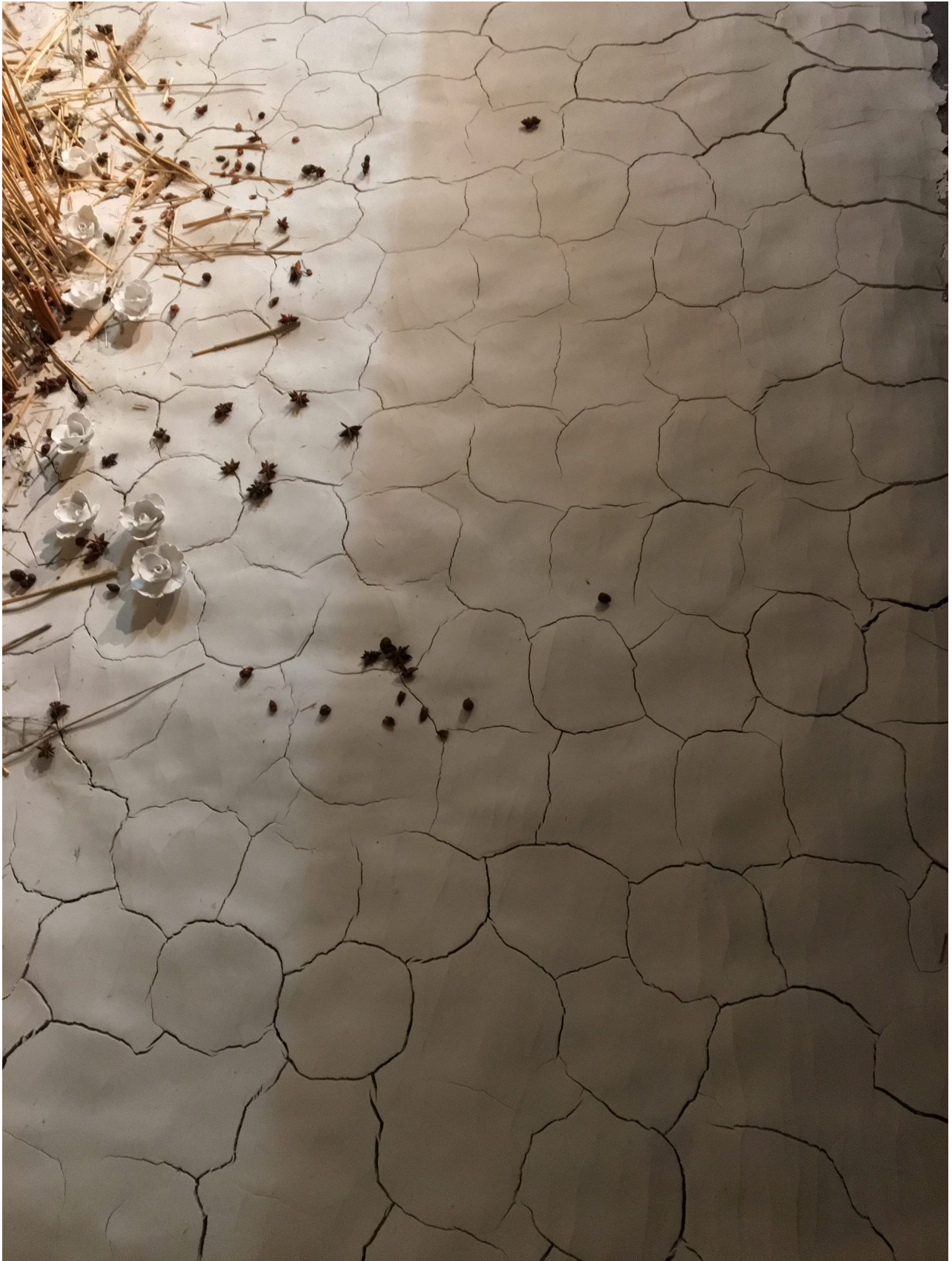
Figures 13 & 14: Details of Lilith by the Red Sea Carpet , showing its initial smooth surface (top image) and its subsequent cracking

Clay has a conceptual status in Lilith by the Red Sea Carpet . According to Lilith mythology, man and his first