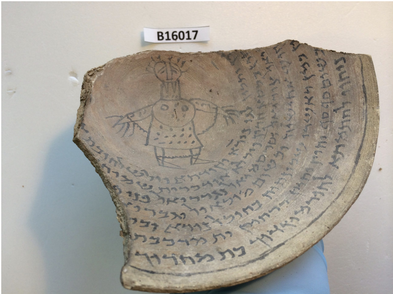
Figure 15: Demon illustration with bird-like features on Penn Museum bowl B16017

Lilith by the Red Sea Carpet 's title foregrounds a series of mistranslations from Old Testament Hebrew: from 'Yam Suf – Sea of Reeds' to 'Yam Edom – Sea of Edom' (i.e. geographically located next to land settled by the Edomite people), 17 and finally to 'Red Sea' (Edom to Adom – Red), occurring originally in the first Old Testament Greek translations and later through the English versions. 18 This last mistranslation echoes strangely in the English exchange of 'reed' for 'red'. Through its title, Lilith by the Red Sea Carpet echoes other mistranslations, mistransliterations and slippages that occur frequently on the bowl texts, 19 making their translation by contemporary scholars a matter of fierce dispute, while also highlighting my focus on plants, both those growing by the Red Sea and those mentioned in the bowl texts. The reeds growing by the Red Sea in abundance are Phragmites australis , the common reed growing along rivers and marshlands on most continents, botanically classified as both native to the UK and as a rhizome, and botanically emblematic of my interdisciplinary enjumbled practice.